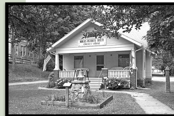
Cheney House Research Center

HELP US CELEBRATE 40 YEARS OF PRESERVING YOUR HERITAGE BY BECOMING A MEMBER!